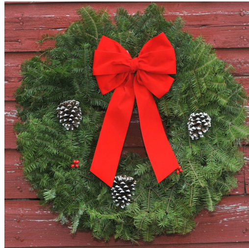
24" Traditional Wreath

Choose the "Simple Plan" to offer just one option. Keep your fundraising efforts easy and simple while still providing a great product!